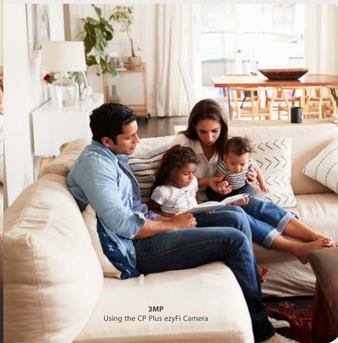
3MP Using the CP Plus ezyFi Camera