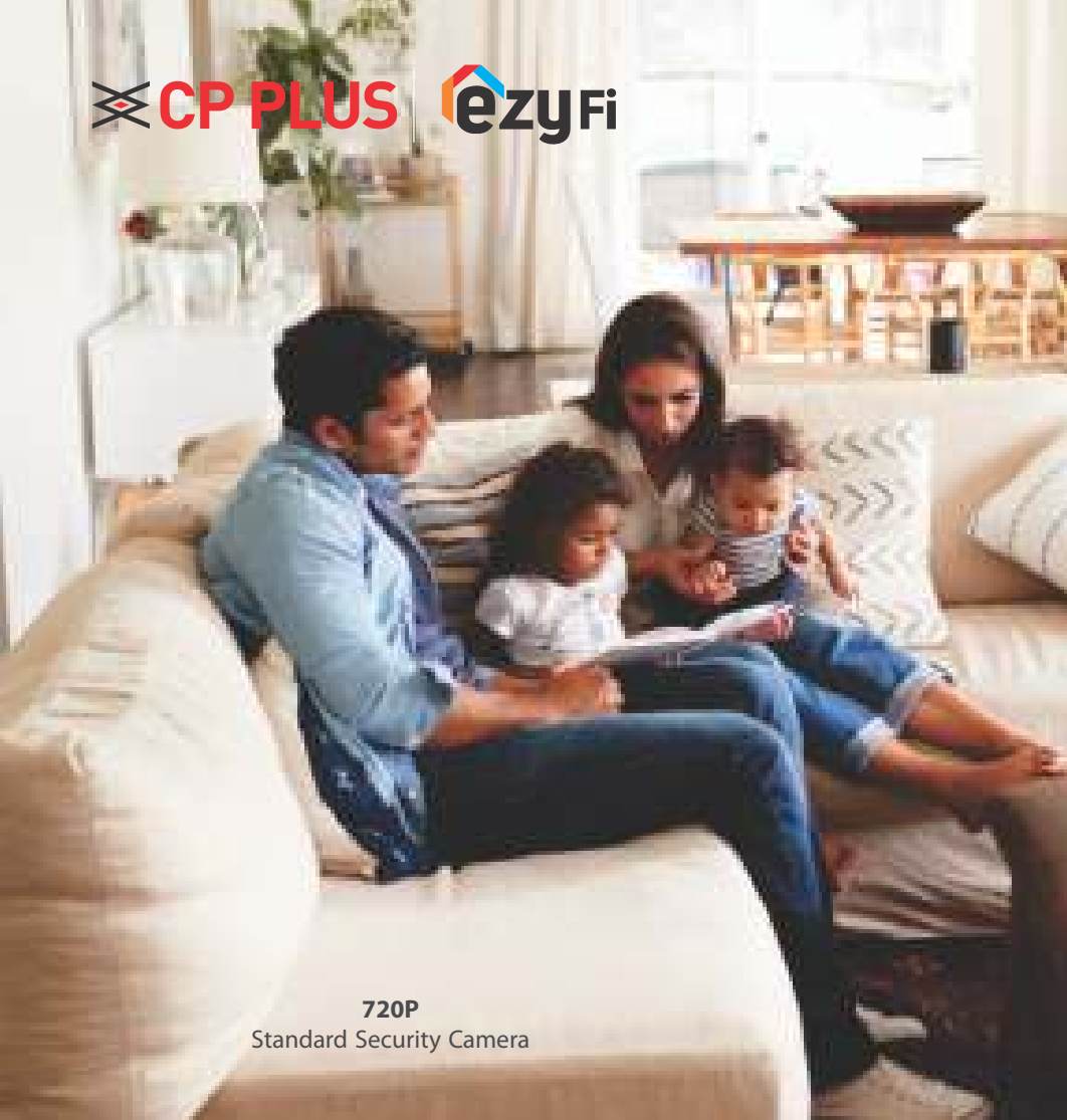
720P Standard Security Camera